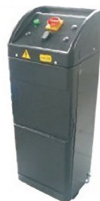
Hydraulic Power Pack