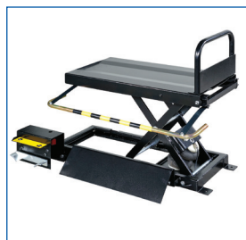
Wheel Lift Part No. OA/900004