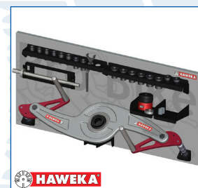
Standard Motorcycle Adapter Kit Part No. HAW/805818000