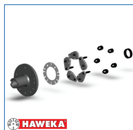
Unilug Adapter Part No. HAW/405818108