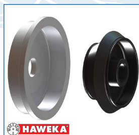
Light Truck Cone Set 88 - 174 mm Part No. HAW/150400091