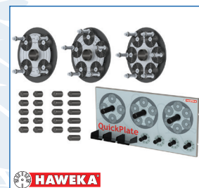
Quick Plates 4, 5 & 6 Hole Part No. HAW/210400001