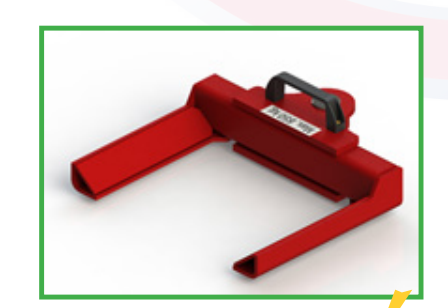
Included as standard