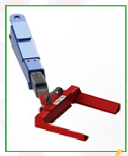
EV lifting fork accessory attached to the lifting arm.