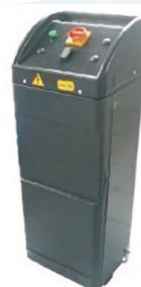
Hydraulic Power Pack

Manual wheel clamp.....OA/61128 Pneumatic wheel clamp.....OA/61129